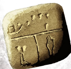
PICTISH CLAY TABLET