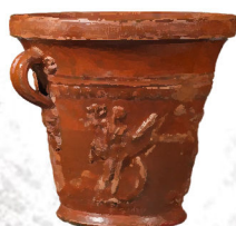
AQUILONIAN BEER MUG