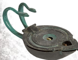
STYGIAN OIL LAMP