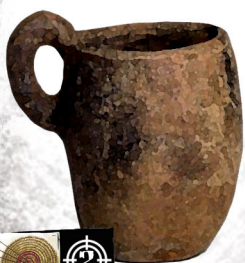
CIMMERIAN BEER MUG