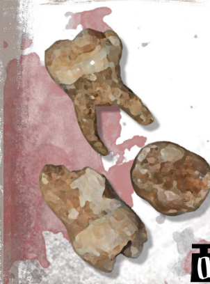
TOOTH & GORE