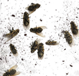
DUST & DEAD FLIES