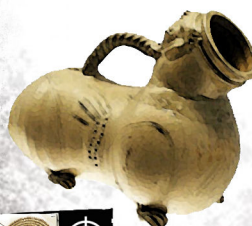
KHITAN CHAMBER POT