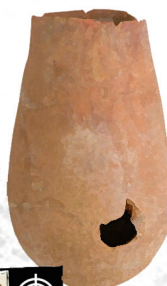
OLD STYGIAN BEER MUG