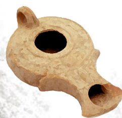
AQUILONIAN OIL LAMP