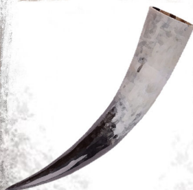
NORDIC DRINKIN' HORN