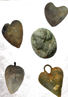
POOR MAN'S JEWELRY