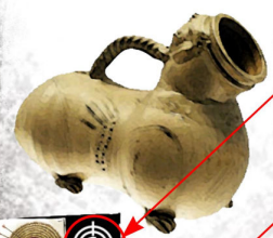
KHITAN CHAMBER POT

Pick a selection of Worthless object cards you need or like. Mix them into your treasure deck. Objects without a range symbol are useless. Objects with a range symbol can be used once.