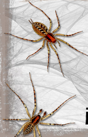
WEBS & SPIDERS