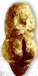
PICTISH PIECE OF ART