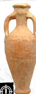
CORINTHIAN WINE JAR