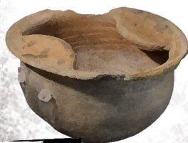
AQUILONIAN CHAMBER POT